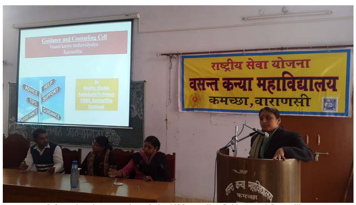
Information given to students during NSS regarding Guidance and Counselling