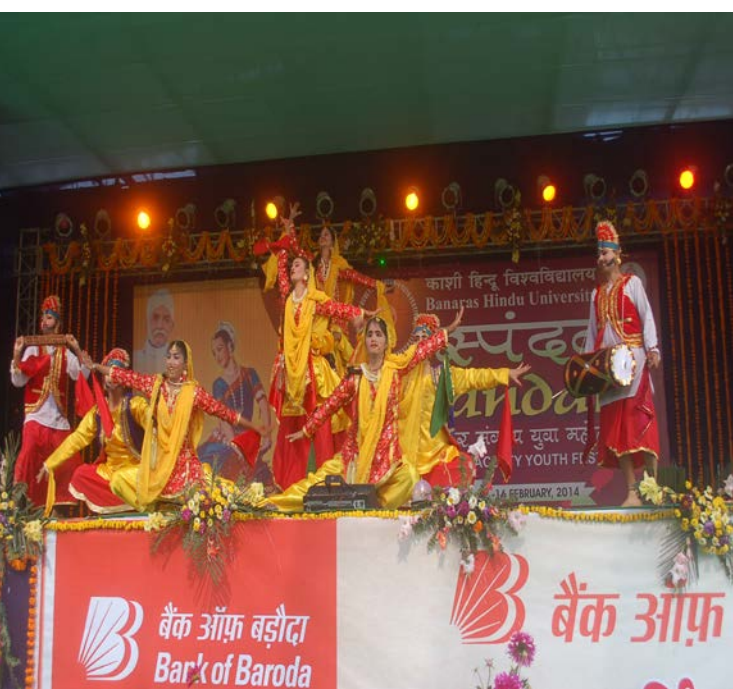
Students of the college performing in Spandan