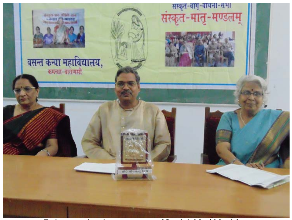
Eminent speakers in a porgramme of Sanskrit Matri Mandalam