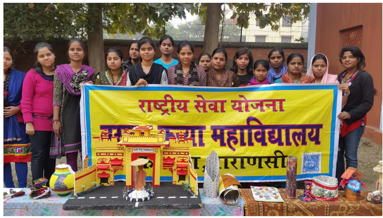
Students displaying their creativity during NSS