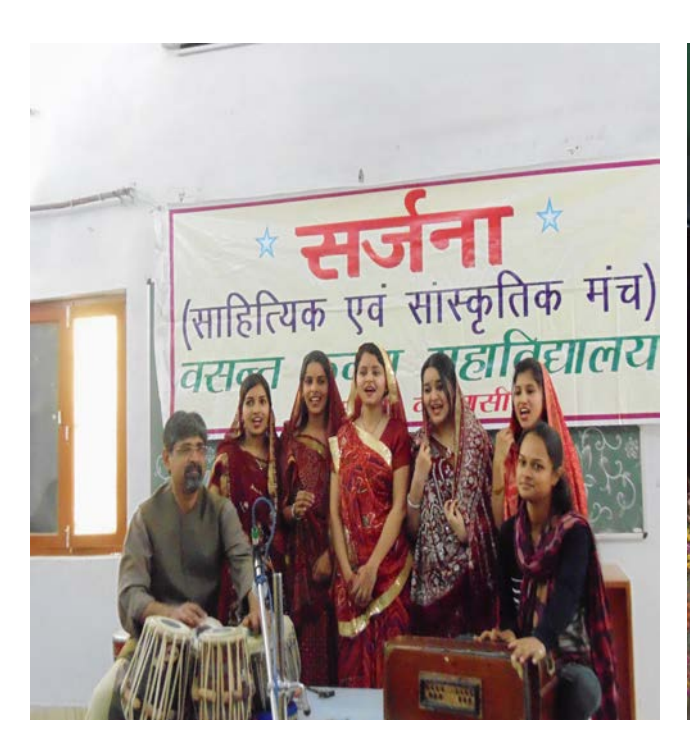
Students in the cultural forum of the College- Sarjana