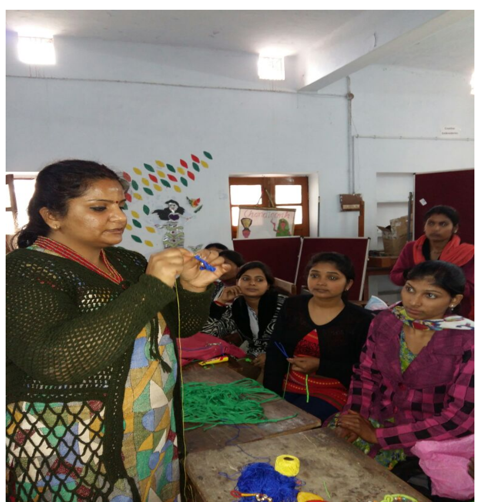
Students at a workshop organized by the Department of Home Science